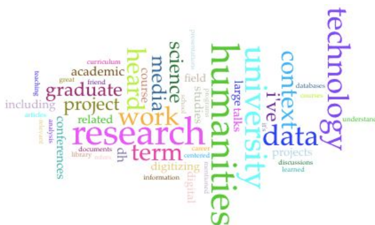
Word cloud of Q46A responses using Voyant (removing phrase "digital humanities")